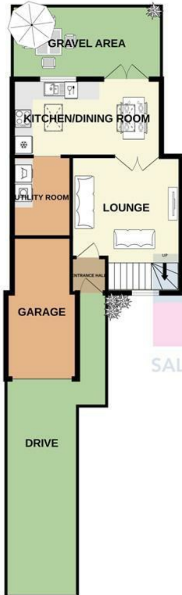
GROUND FLOOR 498 sq.ft. (46.3 sq.m.) approx.